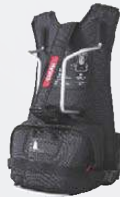
Nylon Backpack (for portable repeater only)(black) NCN010