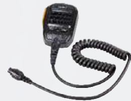
Waterproof Remote Speaker Microphone ( IP67 ) SM18A1

Optional antenna designed by Hytera is highly recommended. *Outdoor use of RD96X with antenna should avoid thunderstorms.