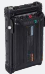
Power Management System PV3001