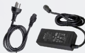
Power Adapter for Portable Repeater PS7502