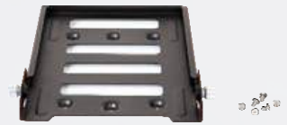
Multi-Functional Installation Bracket BRK17

Optional antenna designed by Hytera is highly recommended. *Outdoor use of RD96X with antenna should avoid thunderstorms.